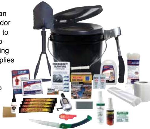
Quake Kare's ER Camping Survival Kit

Four years ago, Quake Kare was acquired by Lighthouse for the Blind, a St. Louis, Missouri-based non-profit organization that provides education, support programs and employment opportunities for visually impaired